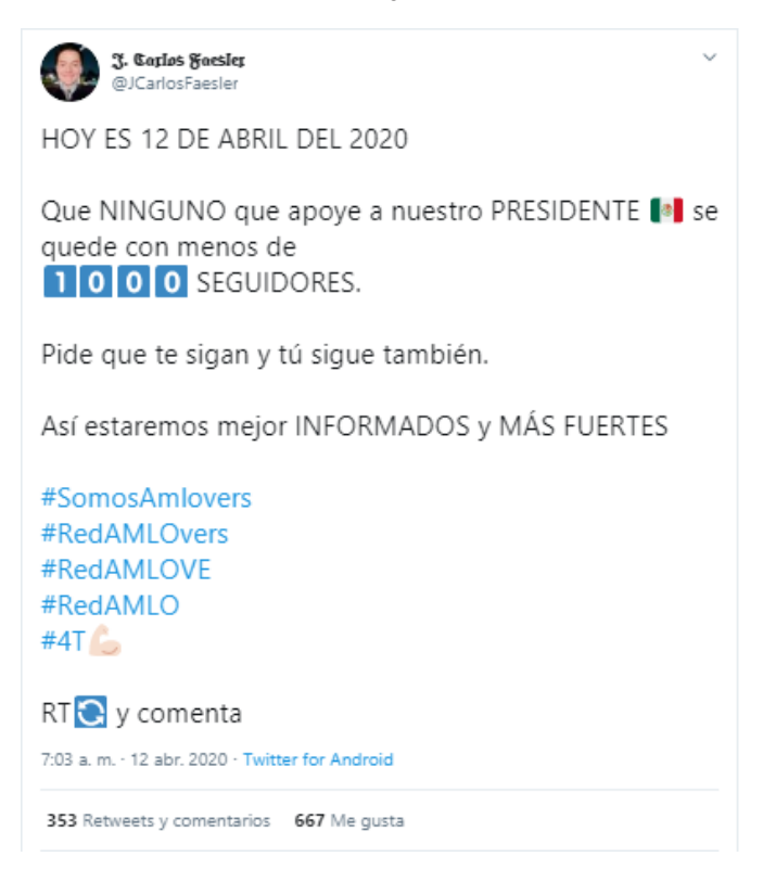
Figure 4 Tweet from @jcarlosfaesler